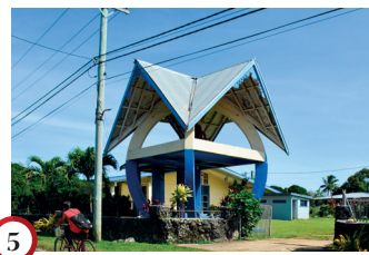
5 Bell Tower. A tour de force of concrete engineering, located on the road to the Mapu 'a Vaea blowholes on the windward southern coast.