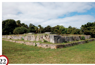
22 Langi, Mu'a. Known as langi, these ancient pyramidal royal tombs are located at the old capital. See map 4 for details. A MUST-SEE