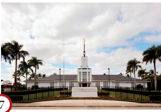
7 Nuku'alofa Tonga Temple and High School, Liahona. This Church of Jesus Christ of Latter-Day Saints (Mormon) Temple was built in 1983, designed by Emil Fetzter in a style similar to other temples around the world.