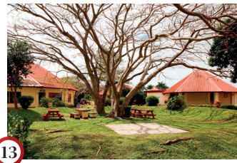
13 University of the South Pacific, Lotoha'apai. Rounds Lee & Partners, from which Jaimi Associates evolved, were both involved in this lovely village-style complex, completed in the early 1990s. A MUST-SEE