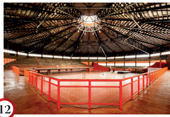
12 'Atele National Indoor Stadium, Lotoha'apai. Designed by Jaimi Associates, responsible for much commercial architecture of the period around the South Pacific. Completed in 1994.