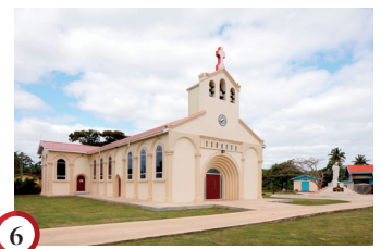
6 Church of the Sacred Heart (Catholic), Houma. A classical church designed and built in 1940 by Father George Callet, involved in the construction of many mid-century churches.