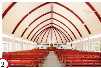
2 Free Wesleyan Church of Tonga, Kolovai. Built in 1976 and one of several small churches of the period adapting the fale form to contemporary church use. A MUST-SEE