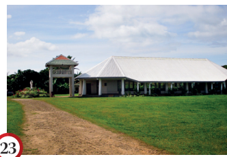
23 St Joseph's Church (Catholic), Kolonga. Another recent church that incorporates a contemporary version of the fale in its design.