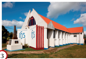
3 Free Wesleyan Church of Tonga, Ha'atafu. Almost post-modern in the use of a broken gable and a Bible design for the façade.