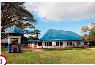
1 Chapel at Sia'atoutai Theological College, Sia'atoutai. The interior is the oldest-surviving chapel in Tonga, the fale Saione (Zion), built in 1865 in Nuku'alofa and relocated here in 1930. A MUST-SEE

0 5 architecturenz AUGUST / SEPTEMBER 2017