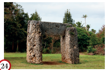
24 Ha'amonga 'a Maui and Maka Fa'akinanga, between Niutoua and Kolonga. The trilithon, dating from c. 1200, is constructed from large slabs of coral limestone. A MUST-SEE