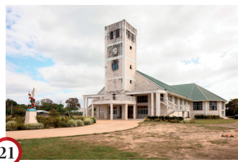
21 St Michael's Church (Catholic), Lapaha. The 1894 stone church was demolished after the 2006 earthquake and rebuilt in 2008 with a tower reminiscent of the original but with a fale-style body.