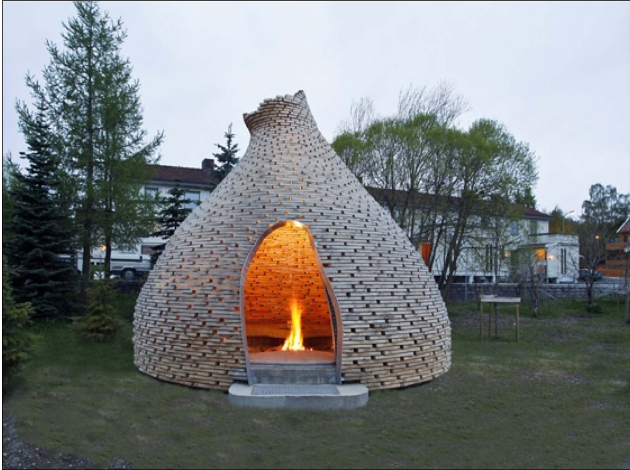
Fireplace For Children, Trondheim, Norway, 2010